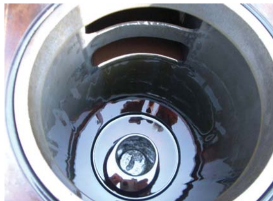
Action to reduce contamination of a Hitachi EX2500 excavator involved installing gaskets when none had been originally provided, left, and providing a flow deflector to protect filter elements from high-velocity oil, which were not provided in the original housing, right.